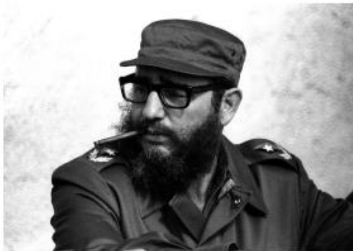
Fidel Castro in November 1976.

Perhaps the most famous attempt to kill Castro came in 1960 when the CIA poisoned a box of his favorite cigars.