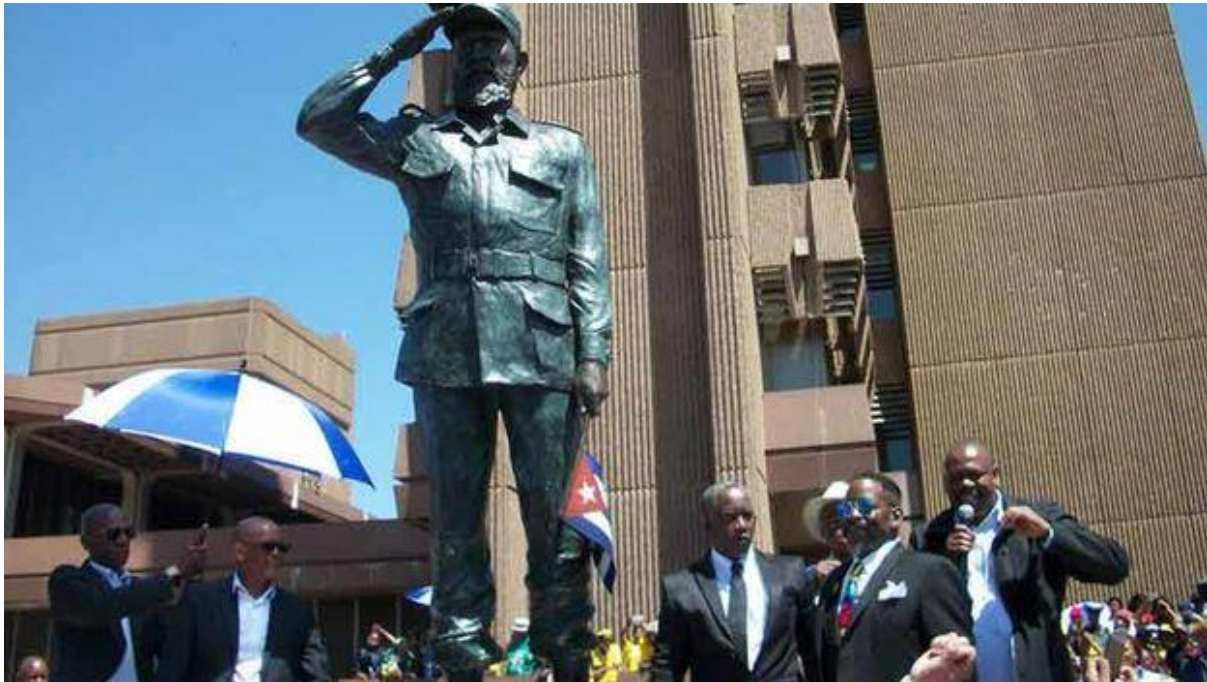
Statue of Fidel Castro in South Africa, unveiled in 2017

https://www.radiohc.cu/en/noticias/nacionales/145438-statues-of-oliver-tambo-and-fidel-castro-unveiled-in-south-africa