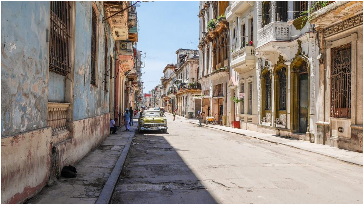
Crumbling buildings and an old car in a street in Havana

https://www.theglobeandmail.com/report-on-business/rob-commentary/no-fidel-castro-did-not-deliver-a-better-cuba/article33071380/