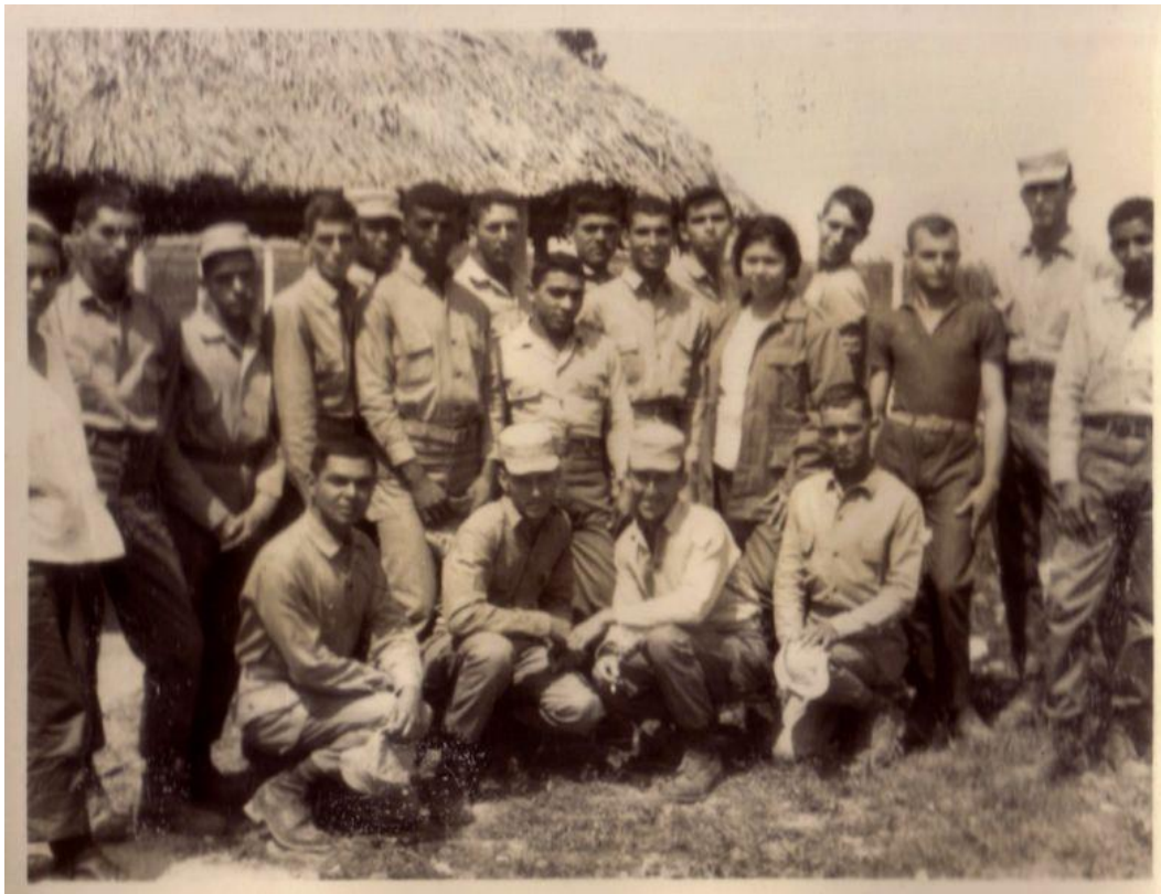
Photo taken by the team of psychologists during a session of [redacted] therapy administered to [redacted] in UMAP [a military labour camp], 1967. (Courtesy of Dr. María Elena Solé)